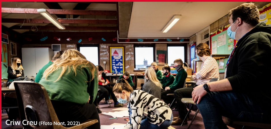
Criw Creu (Foto Nant, 2022)