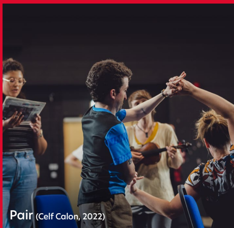
Pair (Celf Calon, 2022)