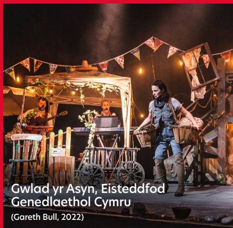
Gwlad yr Asyn, Eisteddfod Genedlaethol Cymru (Gareth Bull, 2022)