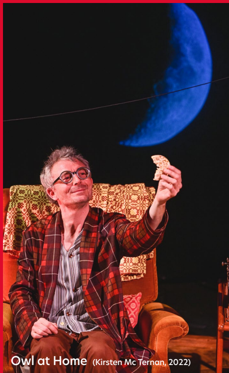
Owl at Home (Kirsten Mc Ternan, 2022)