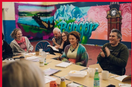
Ar y Dibyn