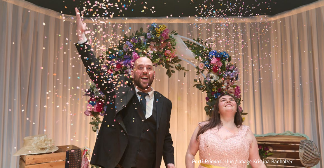
Parti Priodas Llundain