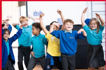
Gweithdy Ysgol Llundain