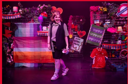
Bren. Calon. Fi.