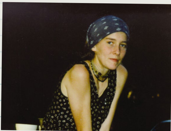
Rachel Corrie (1979 – 2003)