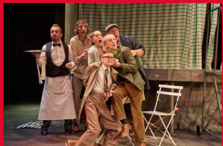
Rhinoseros Llundain